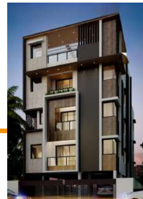
Avadi - chennai