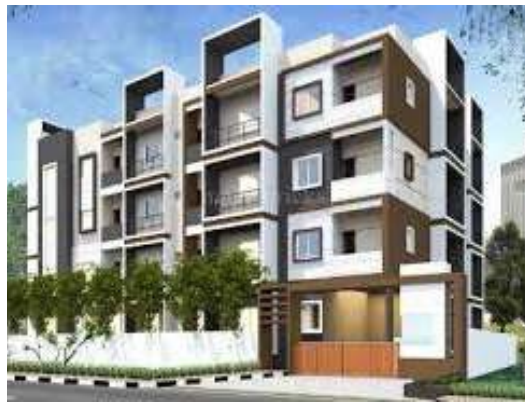
HBR - Bengaluru