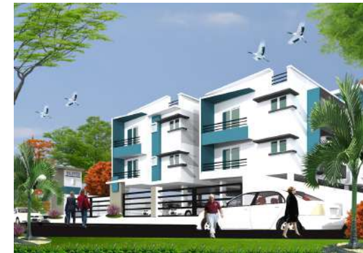
Pallavaram - chennai