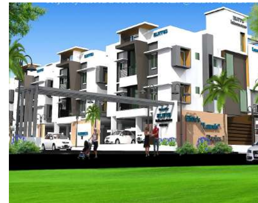
Medavakkam - chennai