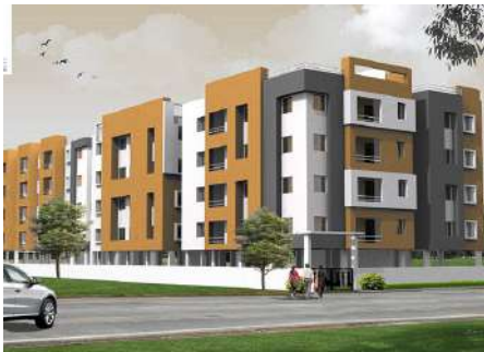
Mogappair - chennai