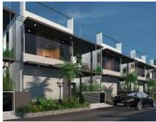
Kannur - Bengaluru