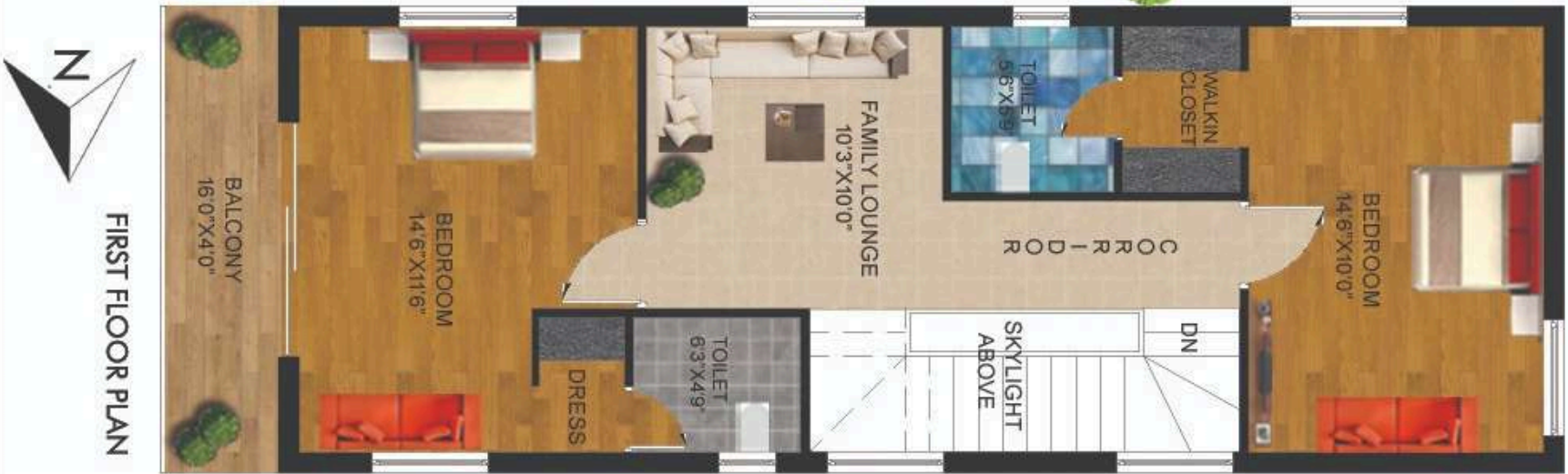
ELITE "SAI MAYOORA VILLAS" - GROUND FLOOR & FIRST FLOOR