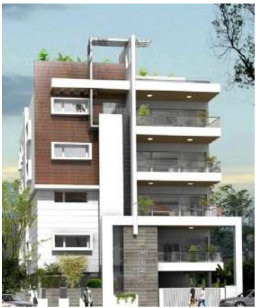
HBR - Bengaluru